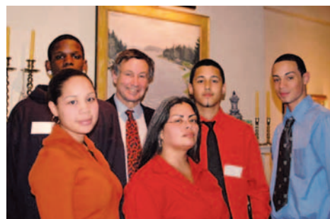
Violence Prevention Program staff and participants.